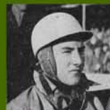
Stirling Moss in '54

The Festival of Motorsport 2004 celebrates 50 years since the creation and launch of "The Liverpool Circuit" within Aintree Racecourse and includes a 3-day programme of special events, live racing action, speciality markets, revival motorsport displays, parades, games, corporate hospitality and fun for motorsport enthusiast and their families. For 2004 highlights please visit www.afms.info or email 2004@afms.info , fax 0151 285 3894