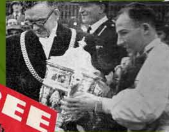
Stirling Moss collecting his trophy from Liverpool's Lord Mayor after winning the Aintree 200 in 1954

Legends Sir Stirling Moss MBE & Tony Brooks have kindly agreed to act as our hosts and hospitality track drivers.